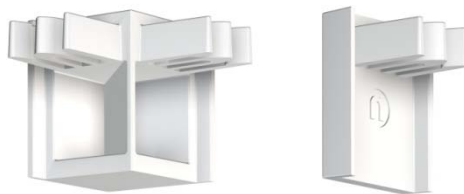
Corner Connector and End Cap Accessories

TIP: For MINI, PRO and GALLERY rails, if the end of the rail is visible, order an "End Cap" to provide a neat and professional finish