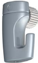
Light Hook (5kg)