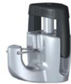
Security Hook (20kg)